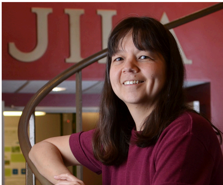
Deborah Jin, a trailblazer of ultracold fermions and molecules and an outstanding mentor to a generation of atomic physicists.